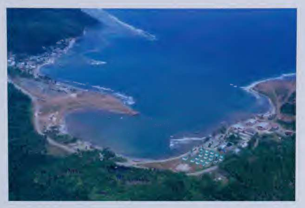
Figure 2 Gambir Bay, with BHP Camp on right and village backed by kebun on left.